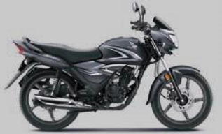
MATTE AXIS GREY