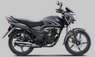
GENY GREY METALLIC