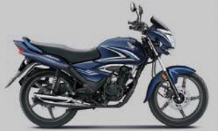
DECENT BLUE METALLIC